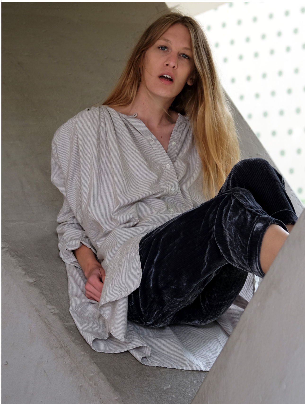
Long Blouse DOROTA 100% high quality Cotton Beige and white striped Made in Portugal