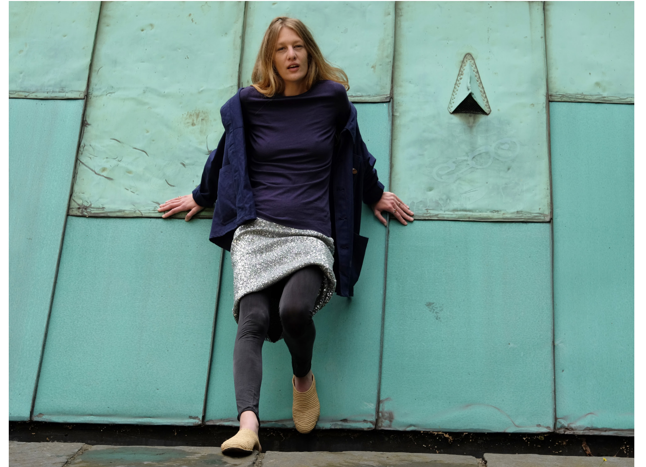
Longsleeve NINA Crew neck, fitted cuffs High quality 69% Cotton, 31% Linen Dark Blue or Broken White Made in Portugal