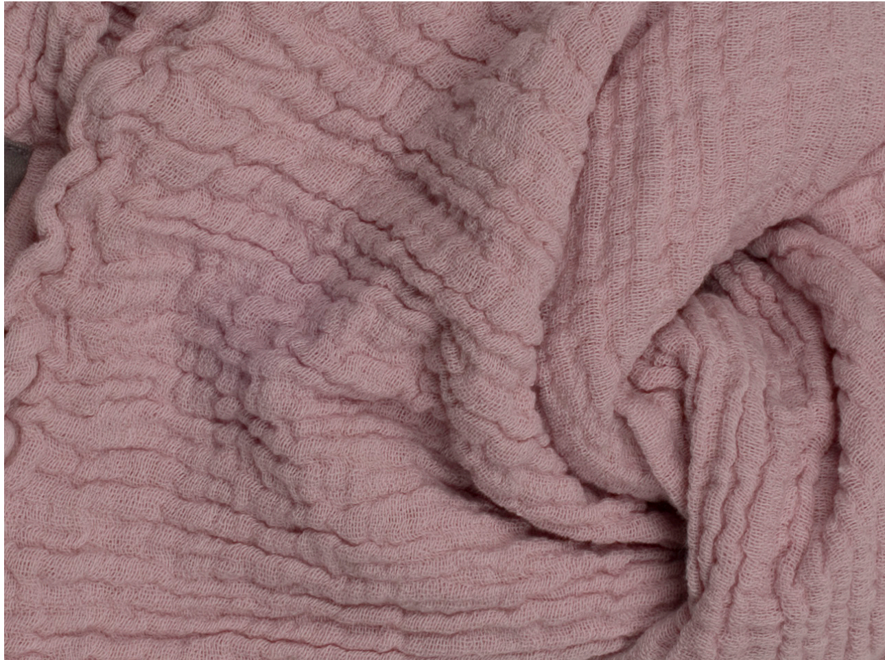
Cloth JAIPUR ROSE 4 sizes Big 140x140 cm Long X 230x70 cm Medium 100x100 cm Small 70x70 cm 100% Muslin Cotton Made in Germany