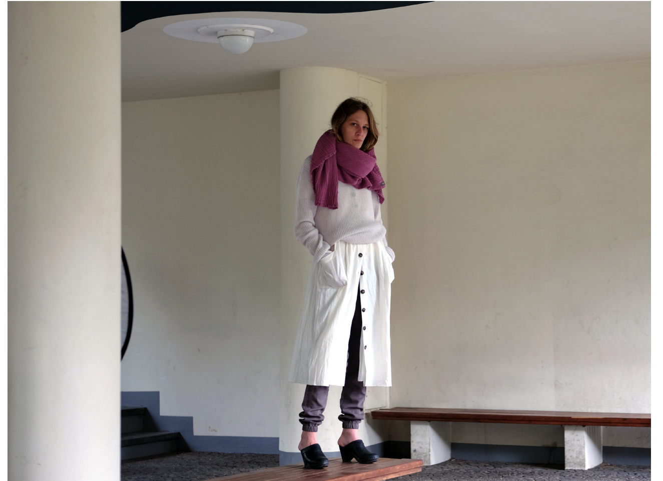
Cloth RASPBERRY SMOOCH Size Big 100% Muslin Cotton Made in Germany