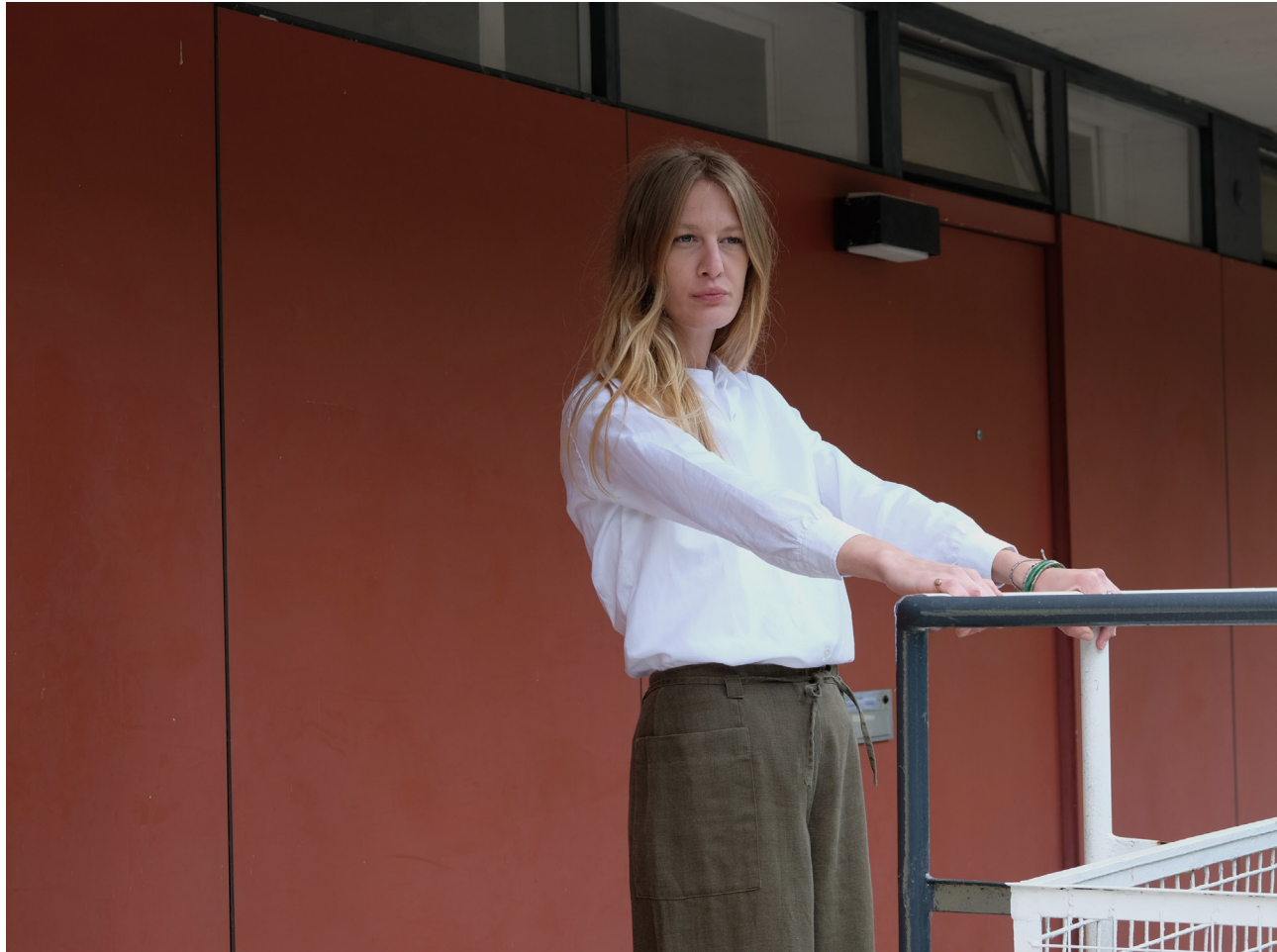
Shirt ALEX 7/8 arm length 100% Oxford Cotton Light grey white Made in Portugal