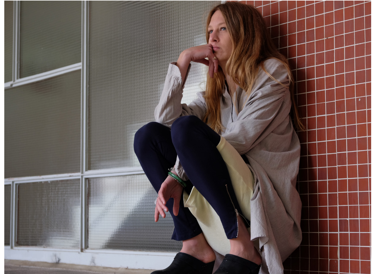
Long Blouse DOROTA 100% Cotton Beige and white striped Made in Portugal