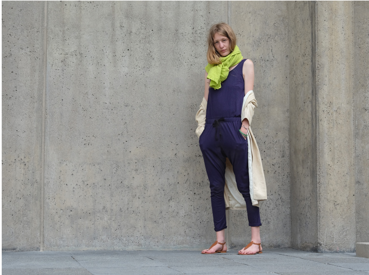
Scarf LEMON CRUSH Size Long X 100% Muslin Cotton Made in Germany