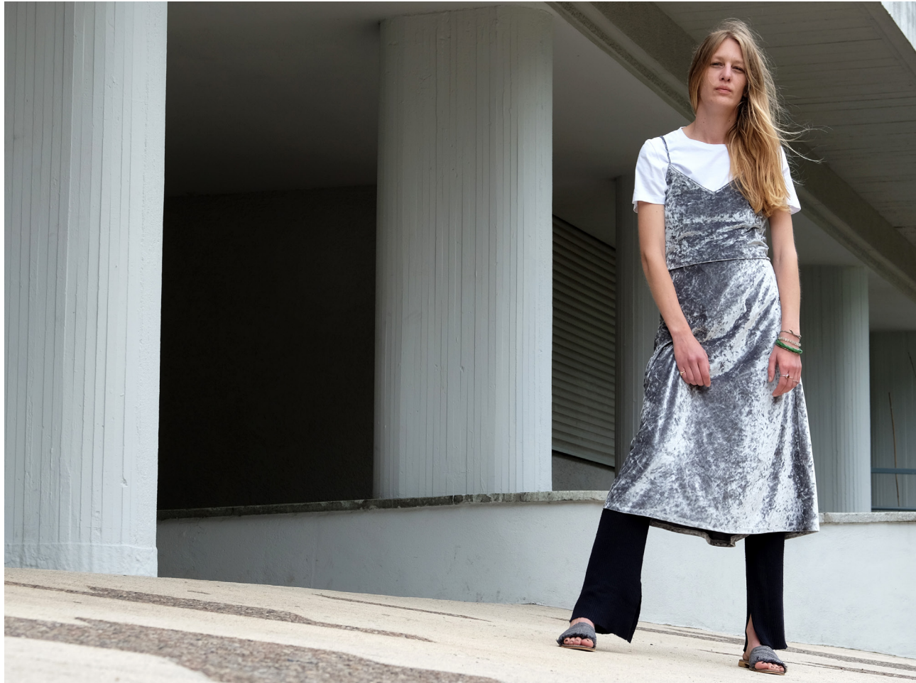
T-Shirt MINE Crew neck 100% Cotton White Made in Portugal