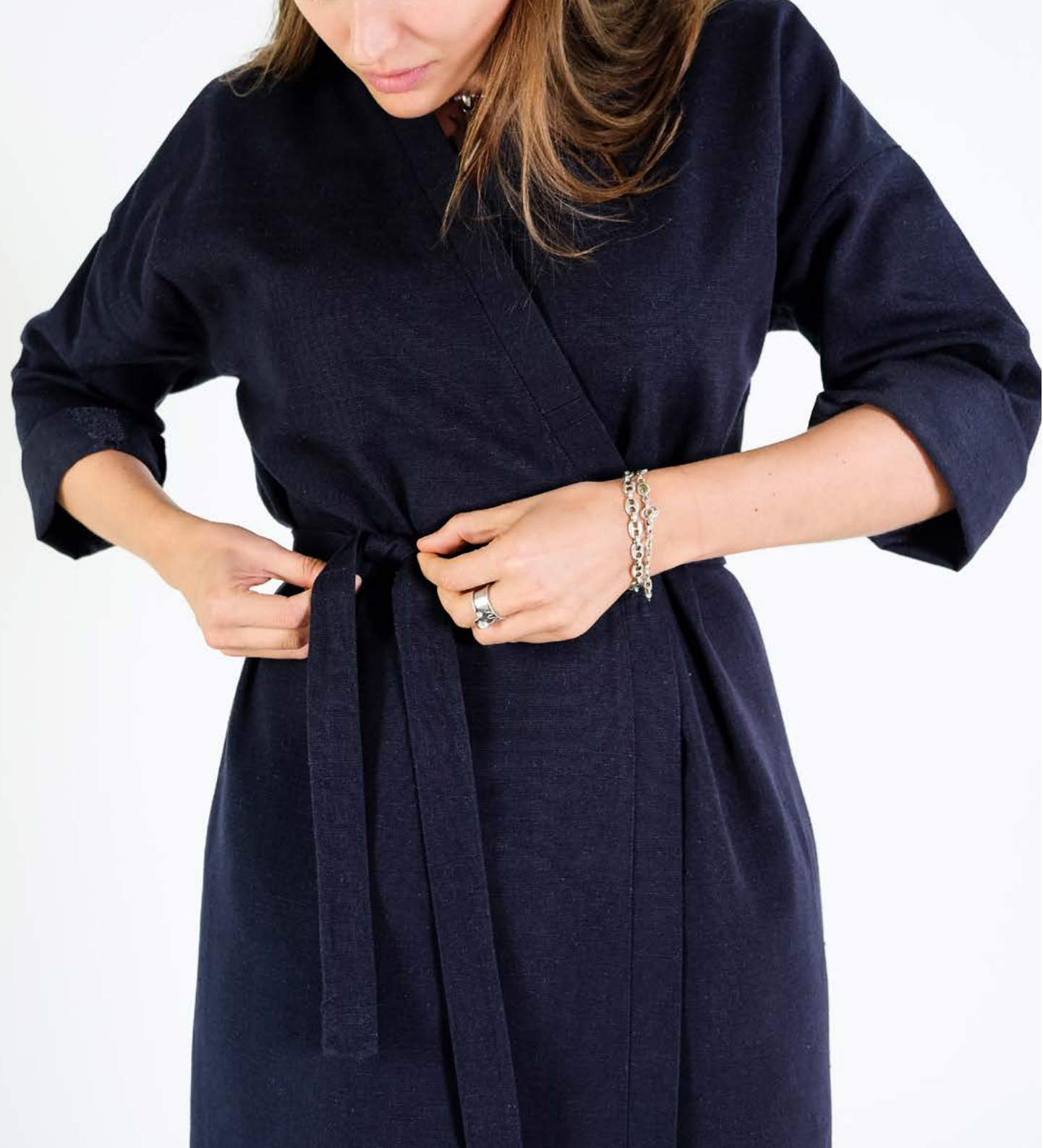
Kimono RAN dress 30% Silk, 70% Cotton Dark Blue Made in Germany