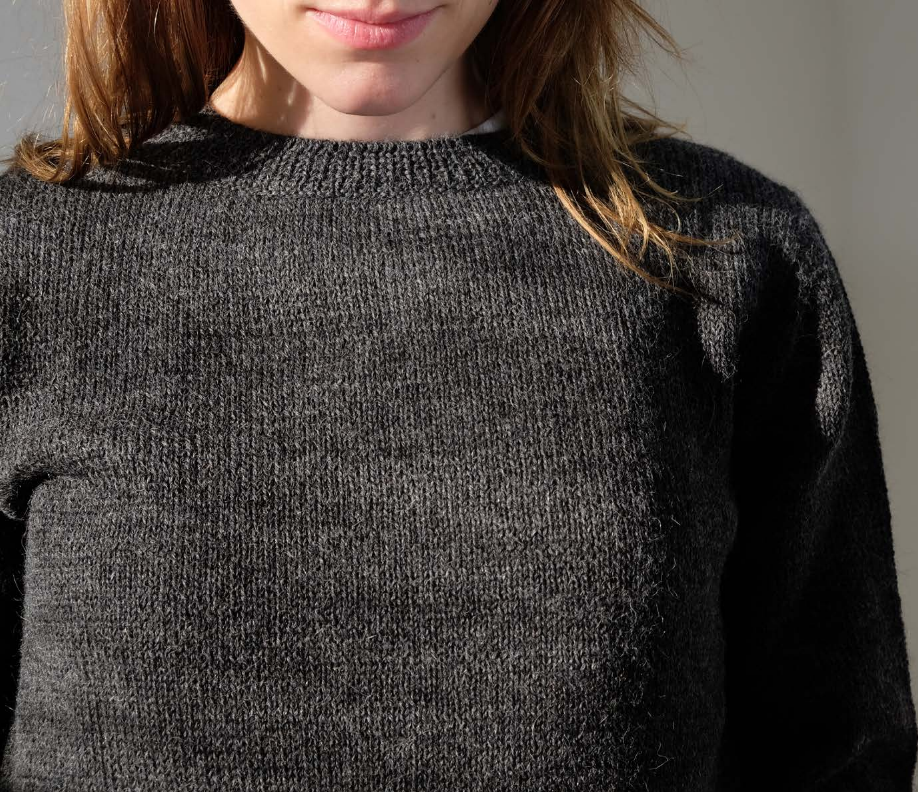
Knit Pullover 100% Alpaca Wool Dark Grey Handmade in Peru