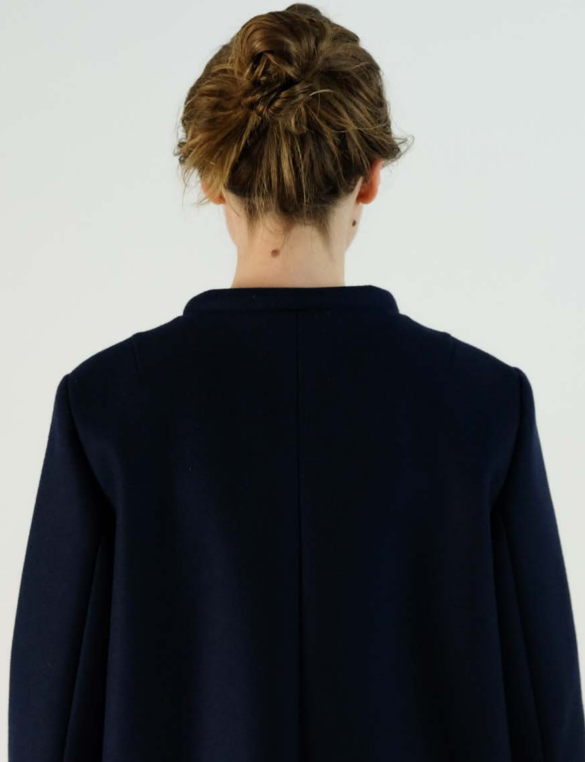
Coat TAO 70% Neopren, 30% PA Dark Blue Made in Germany