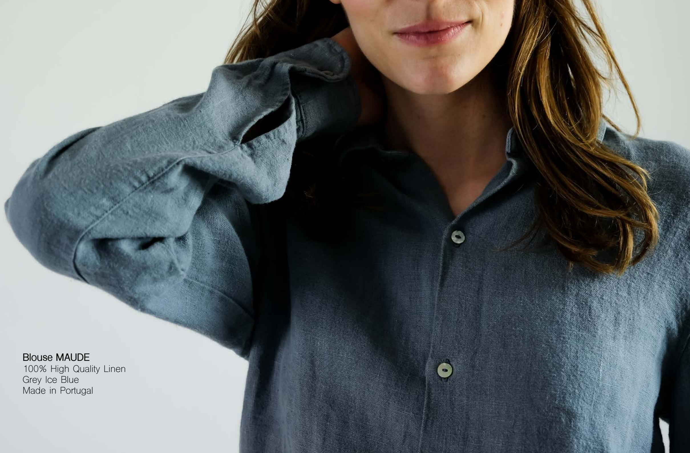
Blouse MAUDE 100% High Quality Linen Grey Ice Blue Made in Portugal