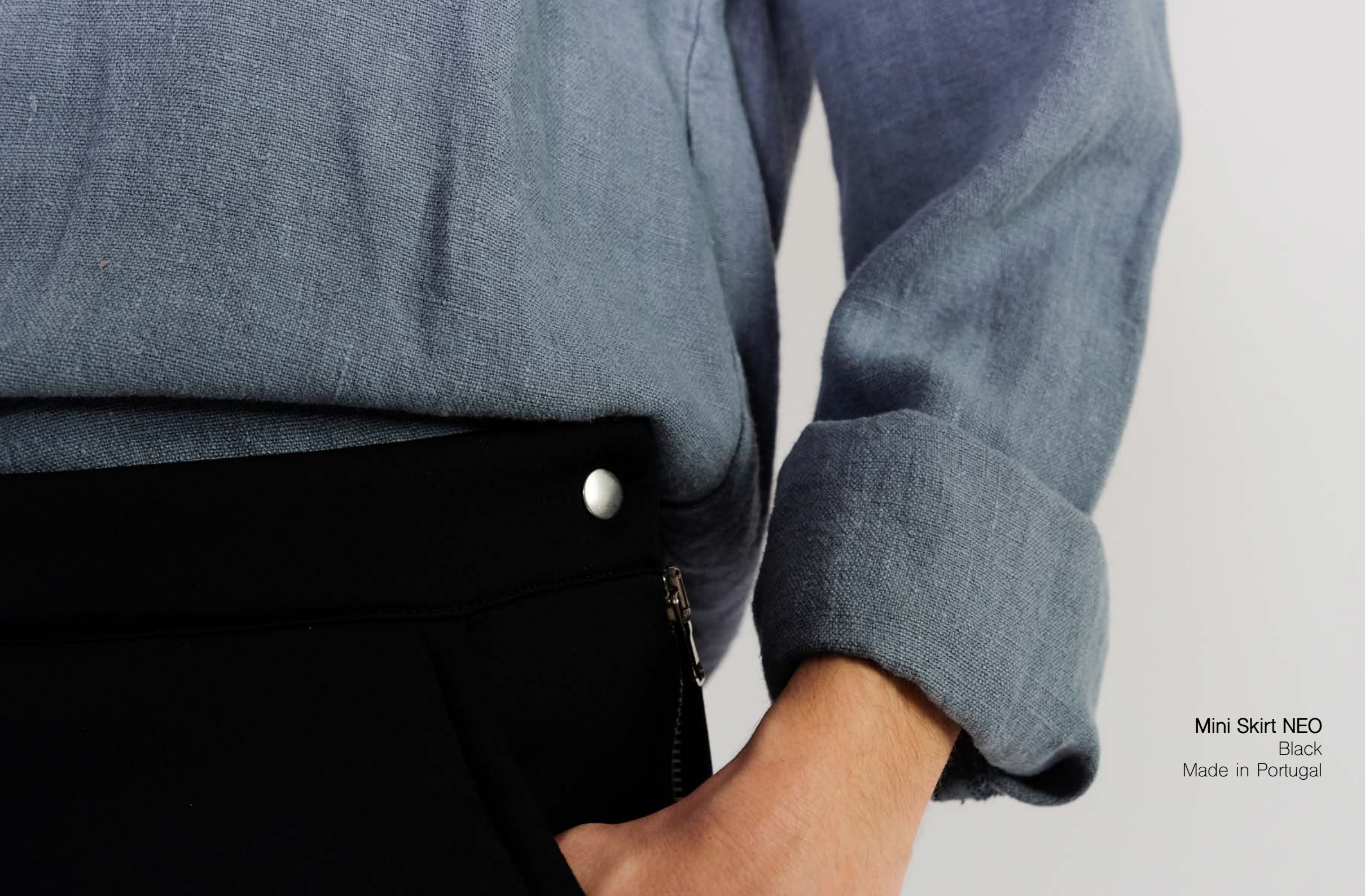
Mini Skirt NEO Black Made in Portugal