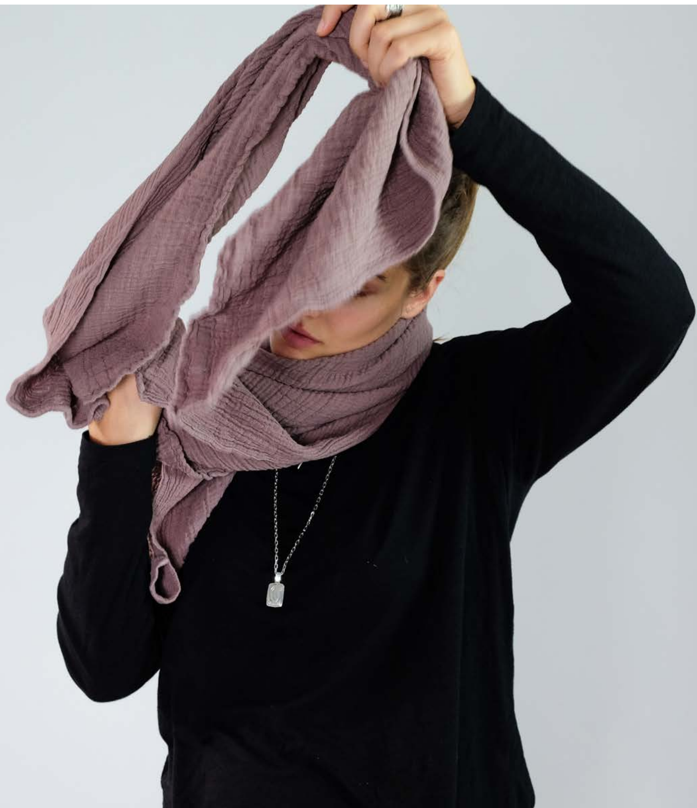
Cloth PURPLE HOPE Size Long 100% Muslin Cotton Made in Germany