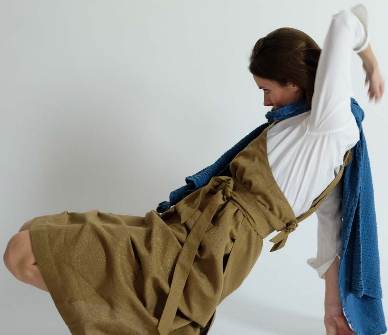
Dress AYA 19% Silk, 10% Linen, 70% Cotton, 1% Metal Gold Made in Germany