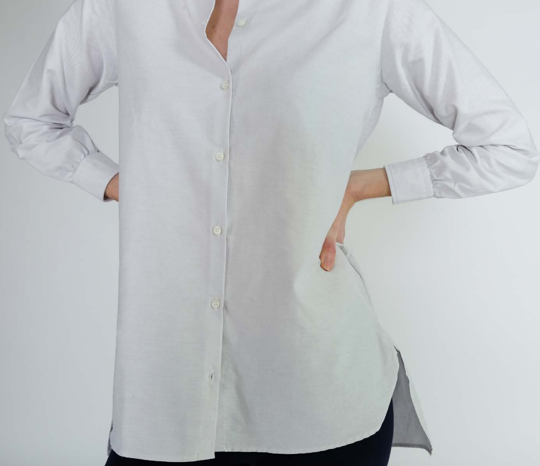
Shirt ALEX 7/8 arm length 100% Oxford Cotton Light Grey White Made in Portugal